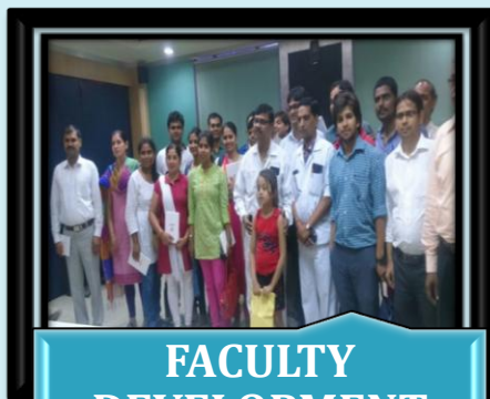
FACULTY DEVELOPMENT PROGRAM