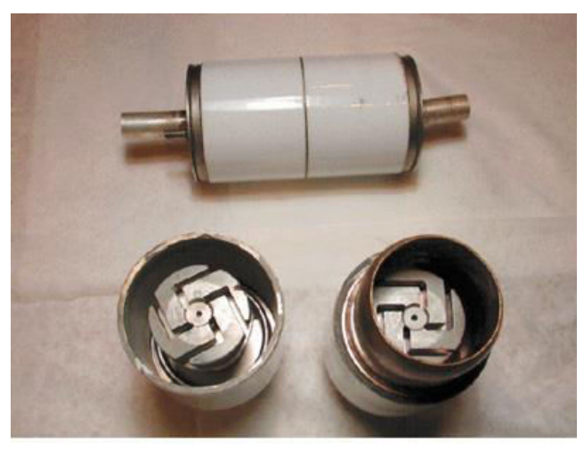
Fig 12 Butt contacts short distance 9.5 mm used in vacuum interrupter in vacuum circuit breaker